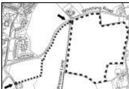
From Hoe Road North to Worthing Road, and a circular route from Primrose Hill to Worthing Road

There are different types of public footpath in the village. Some, such as Harkers Lane, appear on the definitive map of public rights of way and have legal protection for public use. Others are known as permissive pathways. These are time limited agreements between a landowner and the government to open pathways across their land. There are several permissive pathways which have a legal agreement that ends in 2019. These footpaths are: